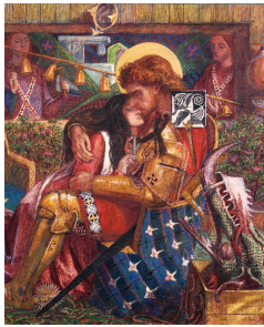
Jacobus de Voragine The Golden Legend