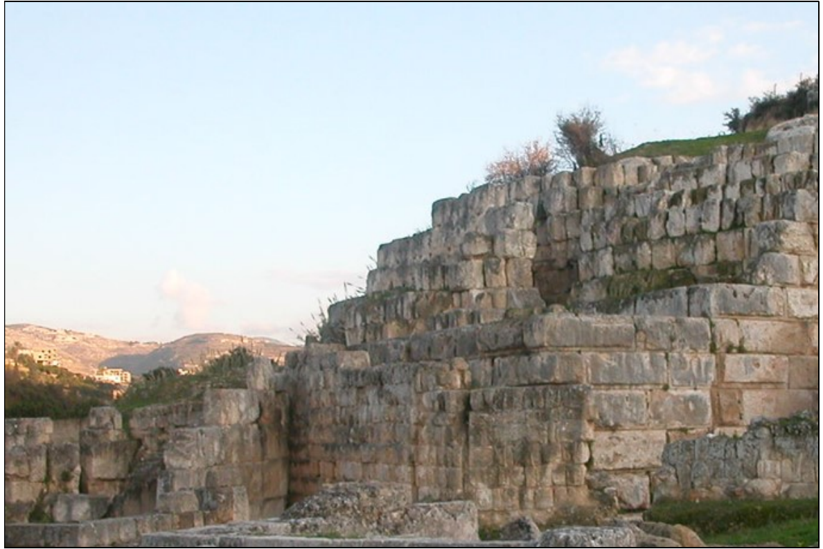
Ancient ruins at Sidon