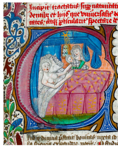
The Book of Margery Kempe