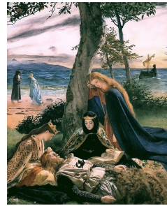
Geoffrey of Monmouth Complete Works