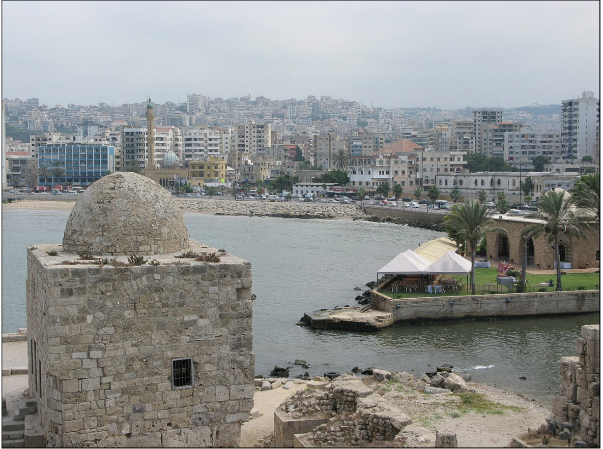
Sidon, the third-largest city in Lebanon, located on the Mediterranean coast in the South Governorate — Antipater's birthplace