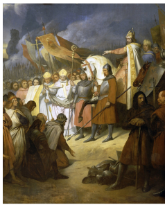
Einhard Collected Works