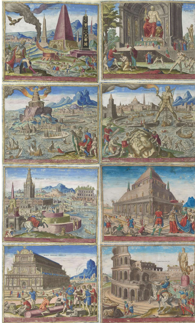
The Octo Mundi Miracula's imagined depictions of the Seven Wonders of the Ancient World, which established the modern canonical list of seven