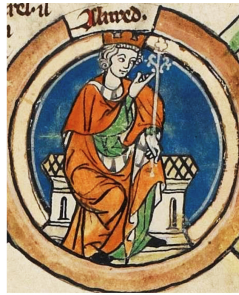
Asser Life of King Alfred