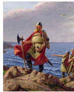
Saxo Grammaticus Gesta Danorum