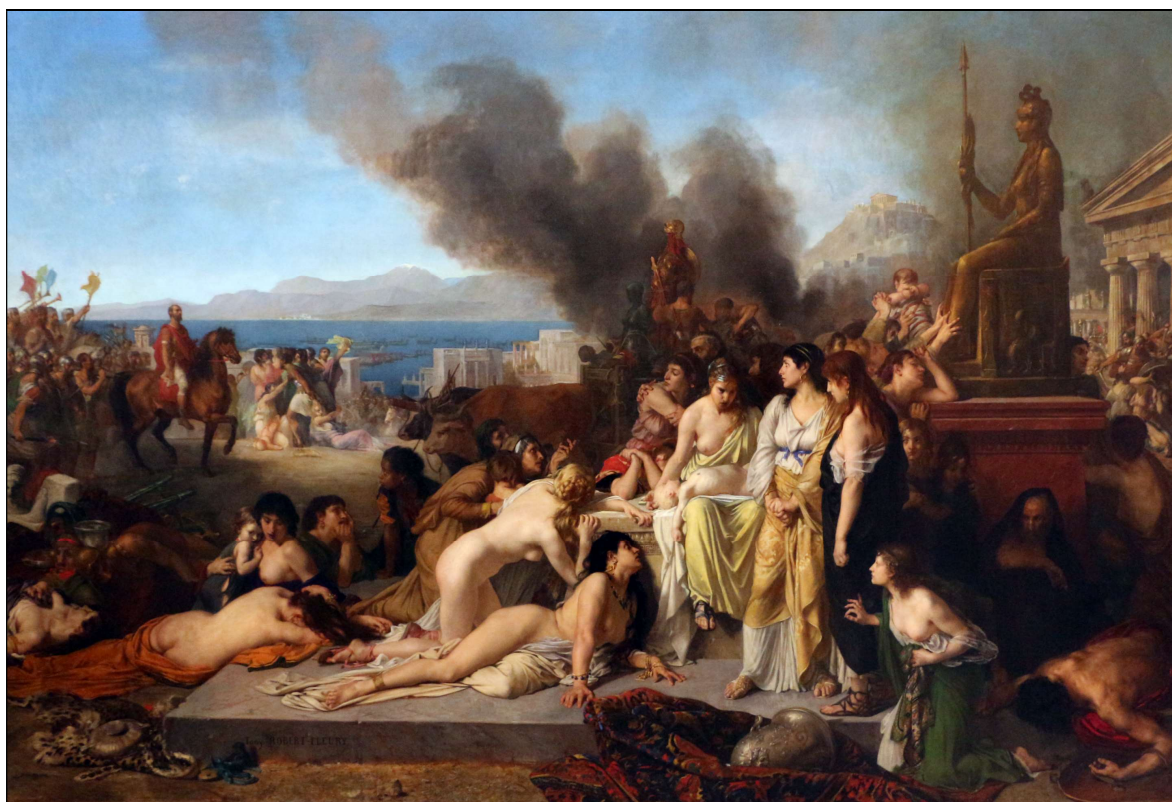
'The Last Day of Corinth' by Tony Robert-Fleury, 1870 — the Sack of Corinth in 146 BC is referenced by Antipater in one of his poems. It was a decisive engagement fought between the Roman Republic and the Greek city-state of Corinth and its allies in the Achaean League. The battle marked the end of the Achaean War and the beginning of the period of Roman domination in Greek history.