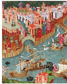
Marco Polo The Travels